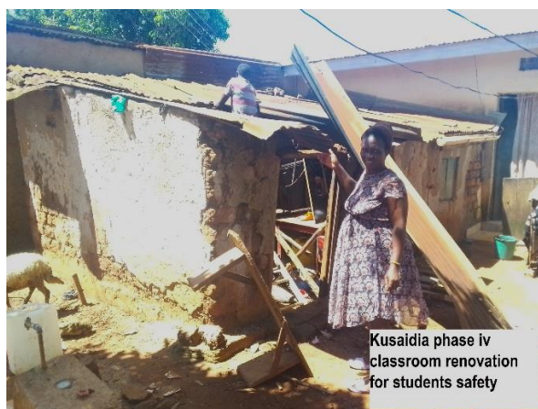
Kusaidia phase iv classroom renovation for students safety

Kusaidia African Life, Kampala, Uganda – The multi-year Women’s Sewing & Embroidery Training Project has received renewed and increased targeted funding support from the Manitoba Council for International Co-operation (MCIC) and the Blennerhassett Family Foundation, in addition to Marquis fundraising. This project includes classroom space, tailoring training, securing jobs for graduates and offering small loans for those wishing to set up their own businesses. The previous office and classroom space was dark, airless and insecure and the new funding has supported Kusaidia in the construction of a new building while continuing their on-going programs. Marquis and Kusaidia are grateful for this support.