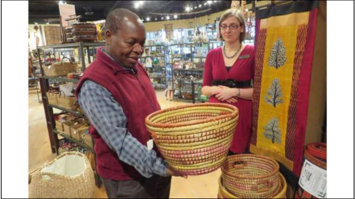
Ten Thousand Villages, Winnipeg, 2016