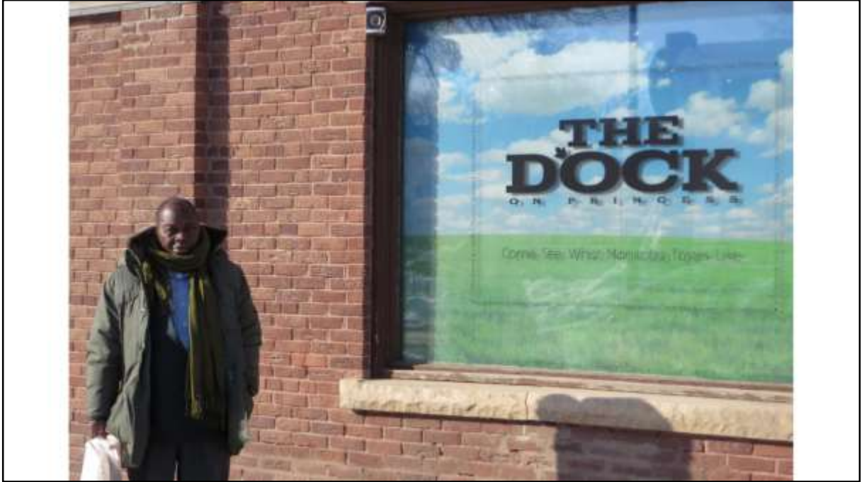
Fair Trade event, Brandon, 2018