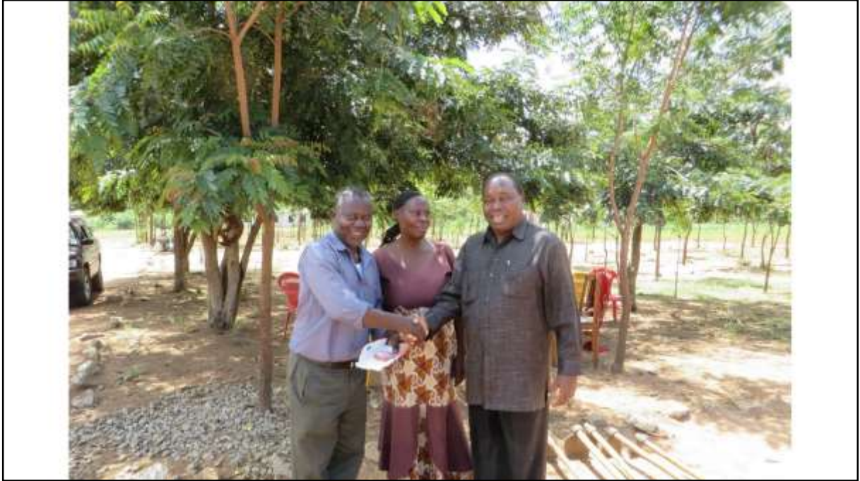
Nyabusalu School project, 2014