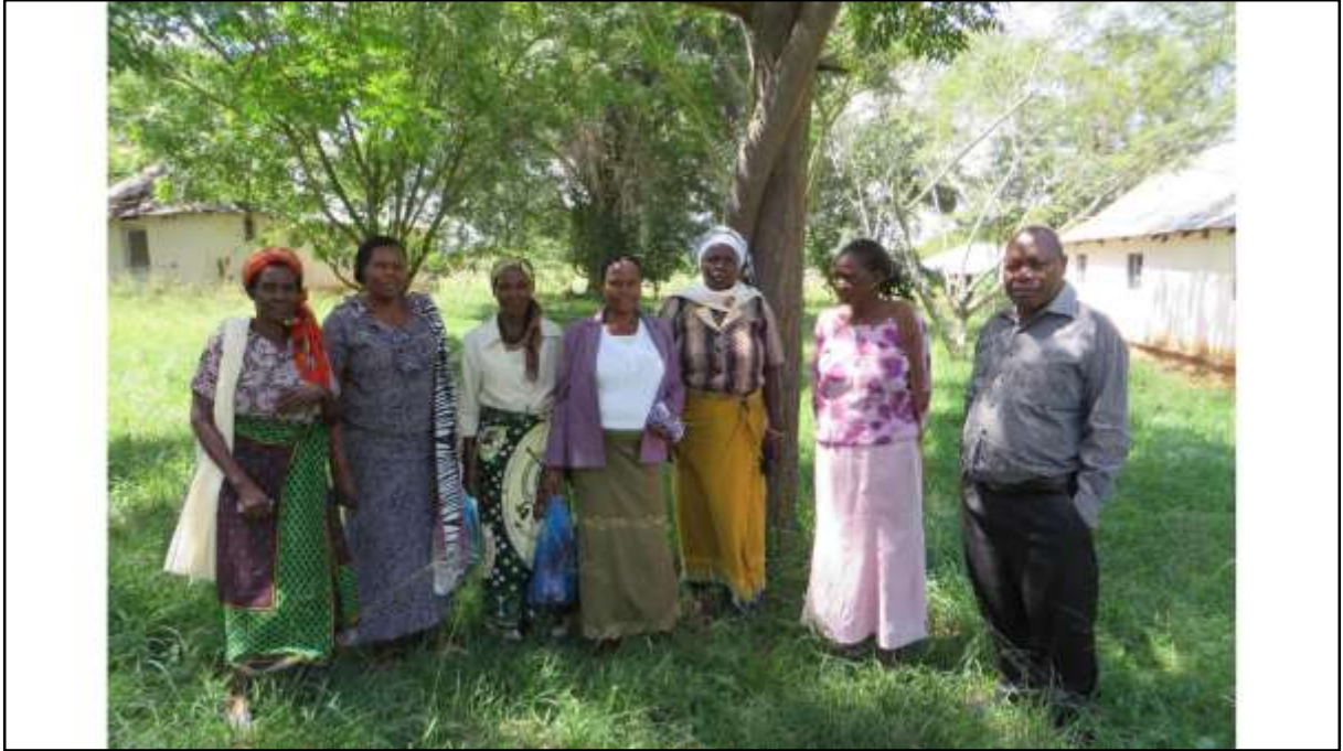
Muwaviwa women's group executive