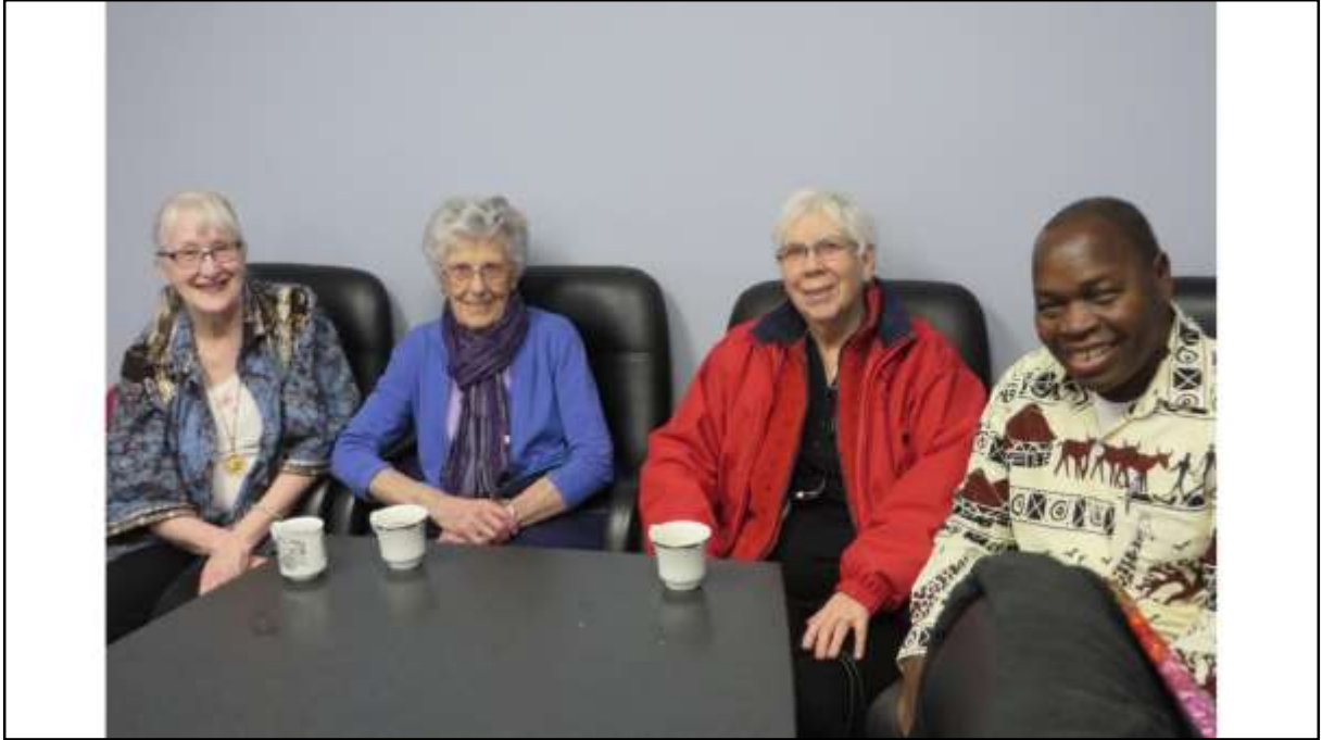
Marquis event, 2016