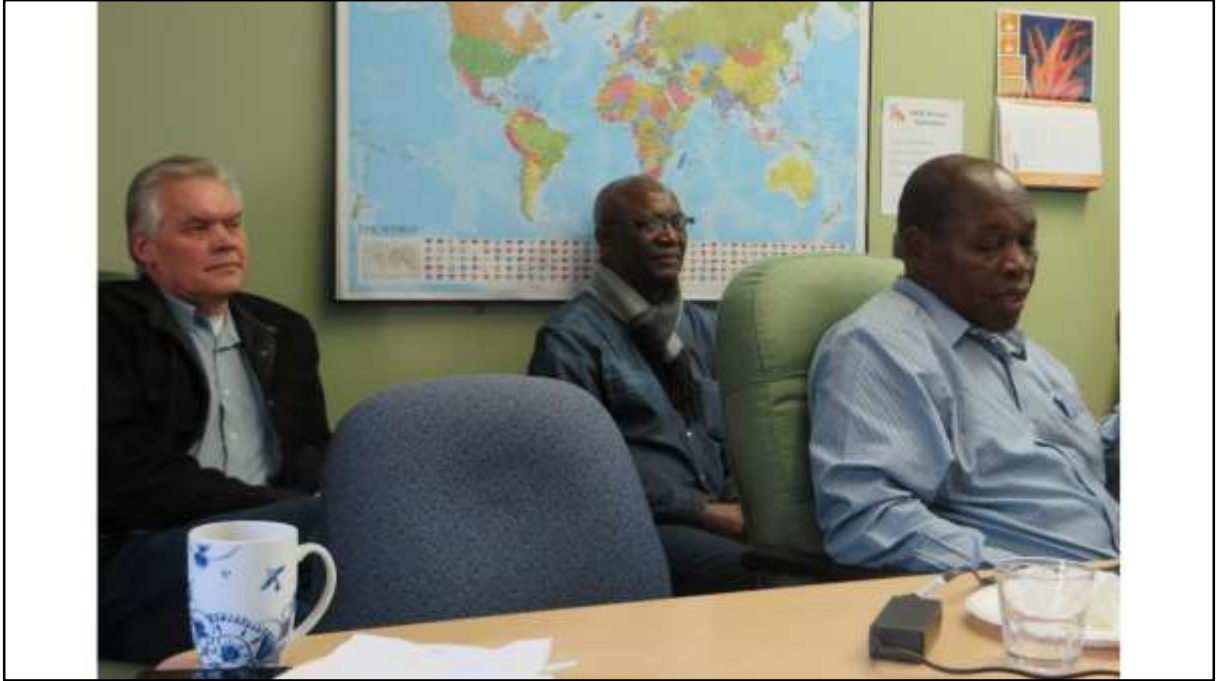
MCIC Lunch & Learn