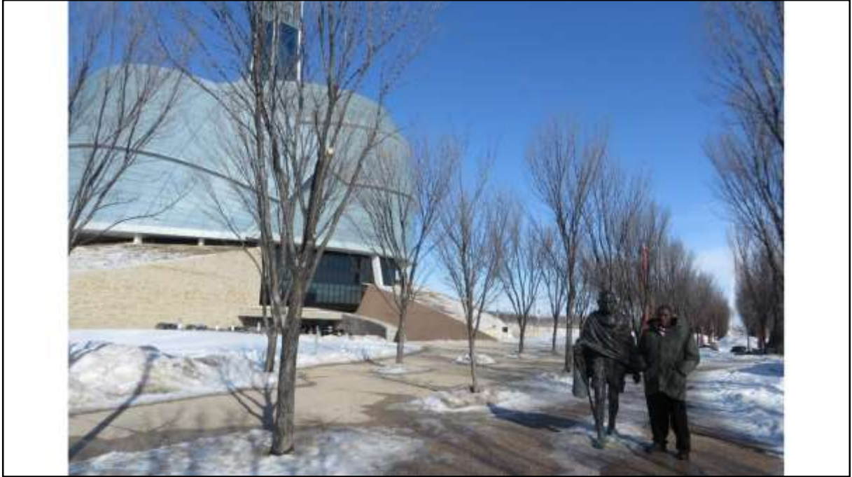
Human Rights Museum, Winnipeg, 2016