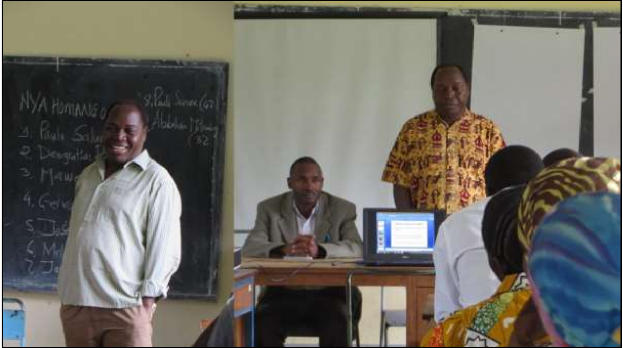
In the classroom