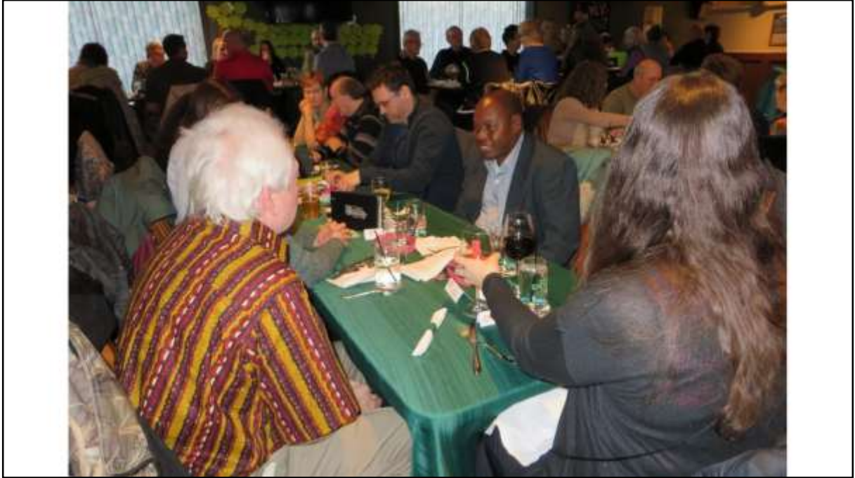
Fair Trade dinner, 2018