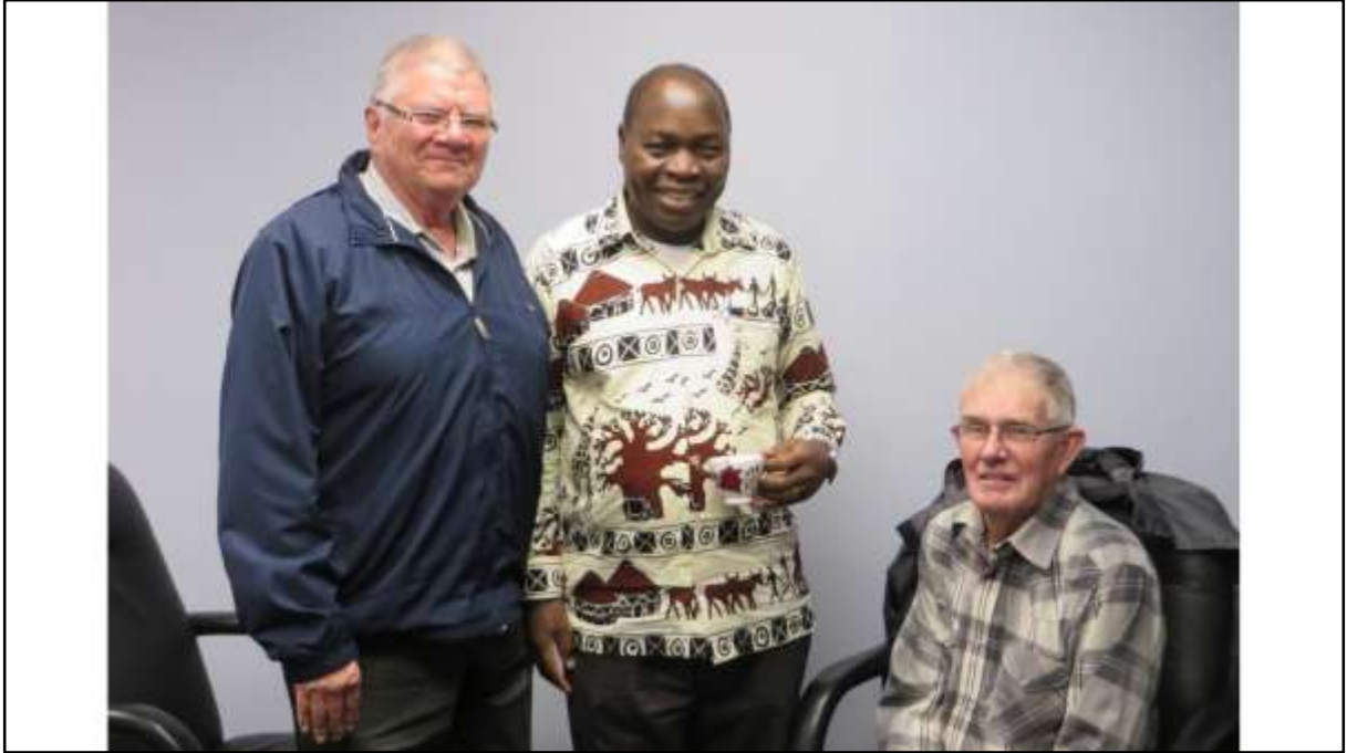
Marquis event, 2016