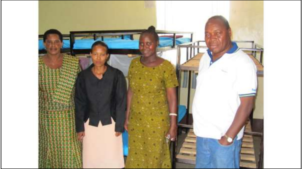
Katesh Hostel, 2012