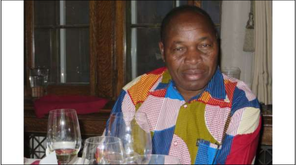
2018 ACC Award Dinner