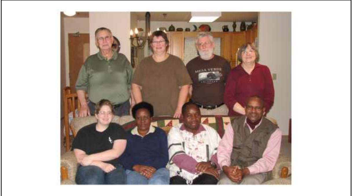
In Gimli with Ceplis and Gross families, 2007