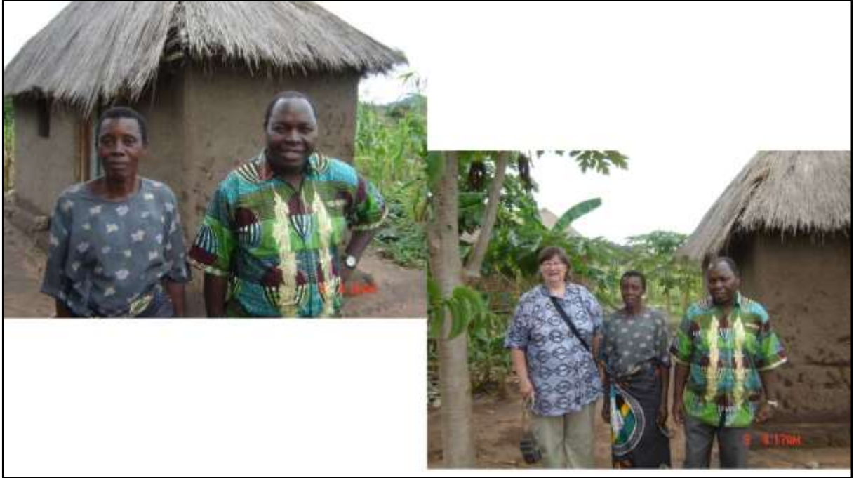
At tree farm, Tanzania