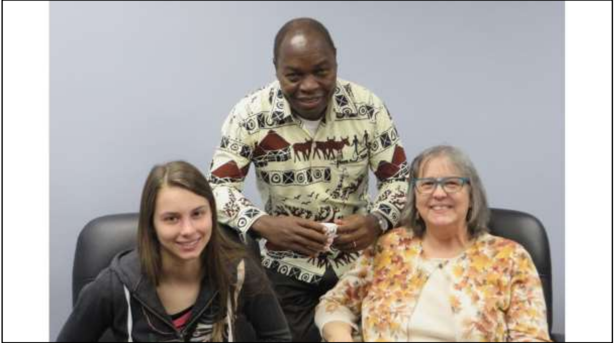
Marquis event, 2016