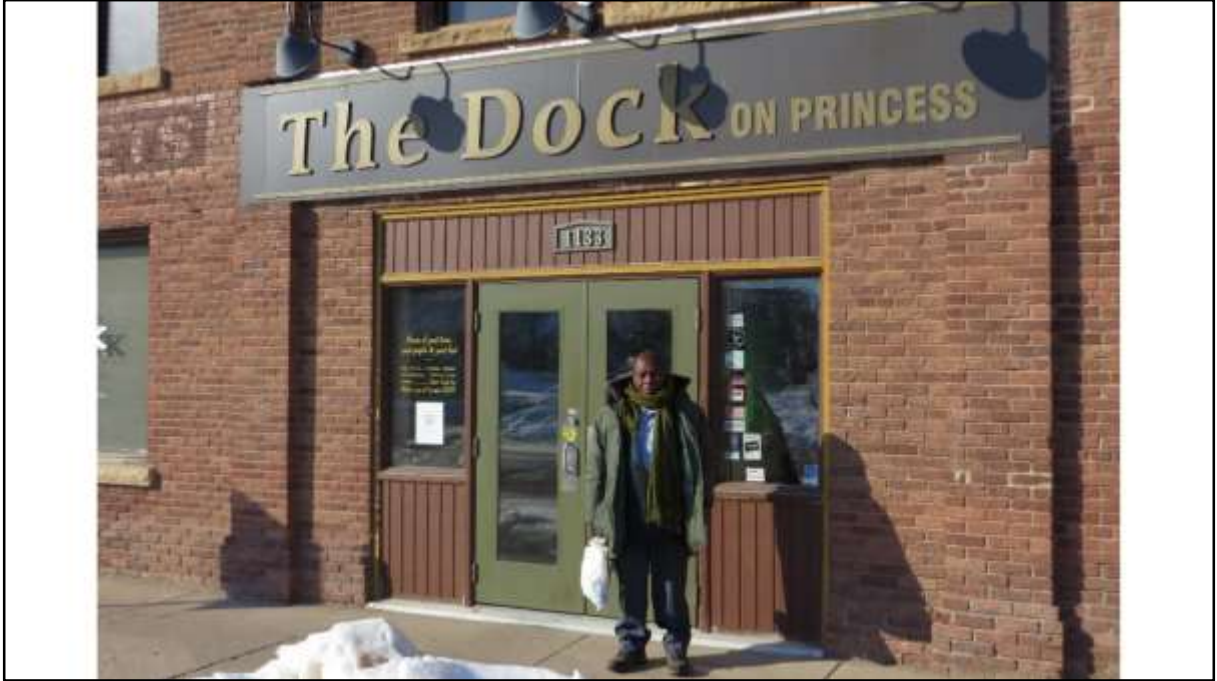
Fair Trade event, Brandon, 2018