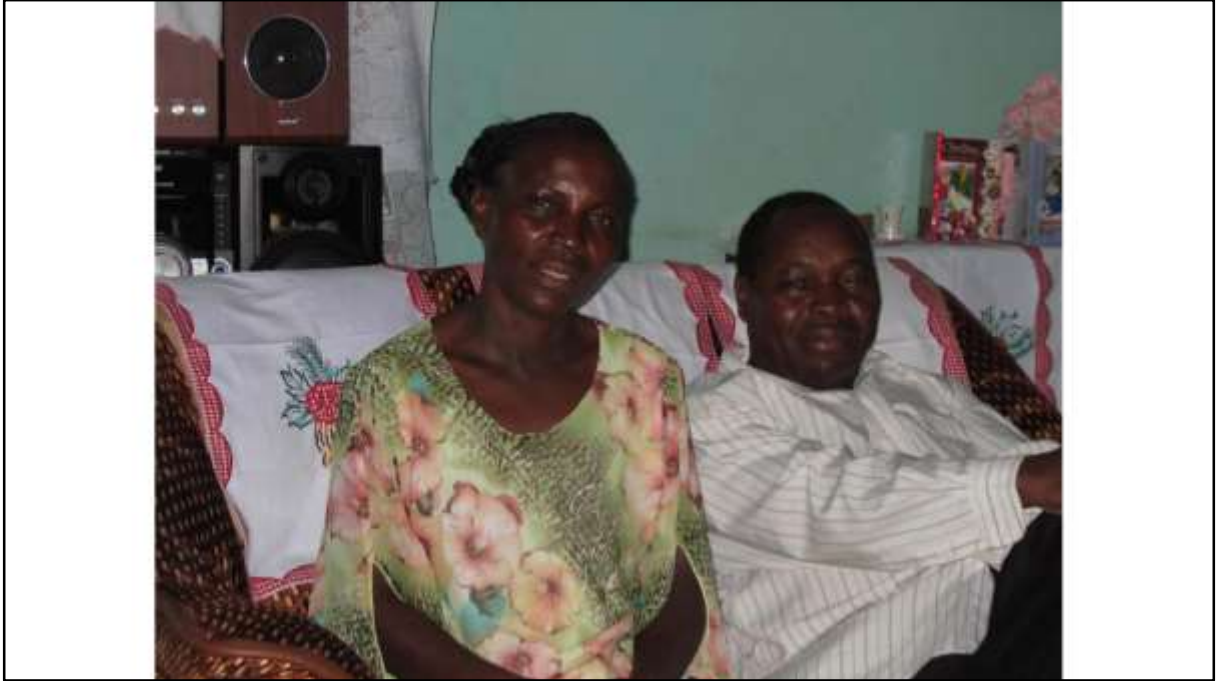
With sister Bette, 2011