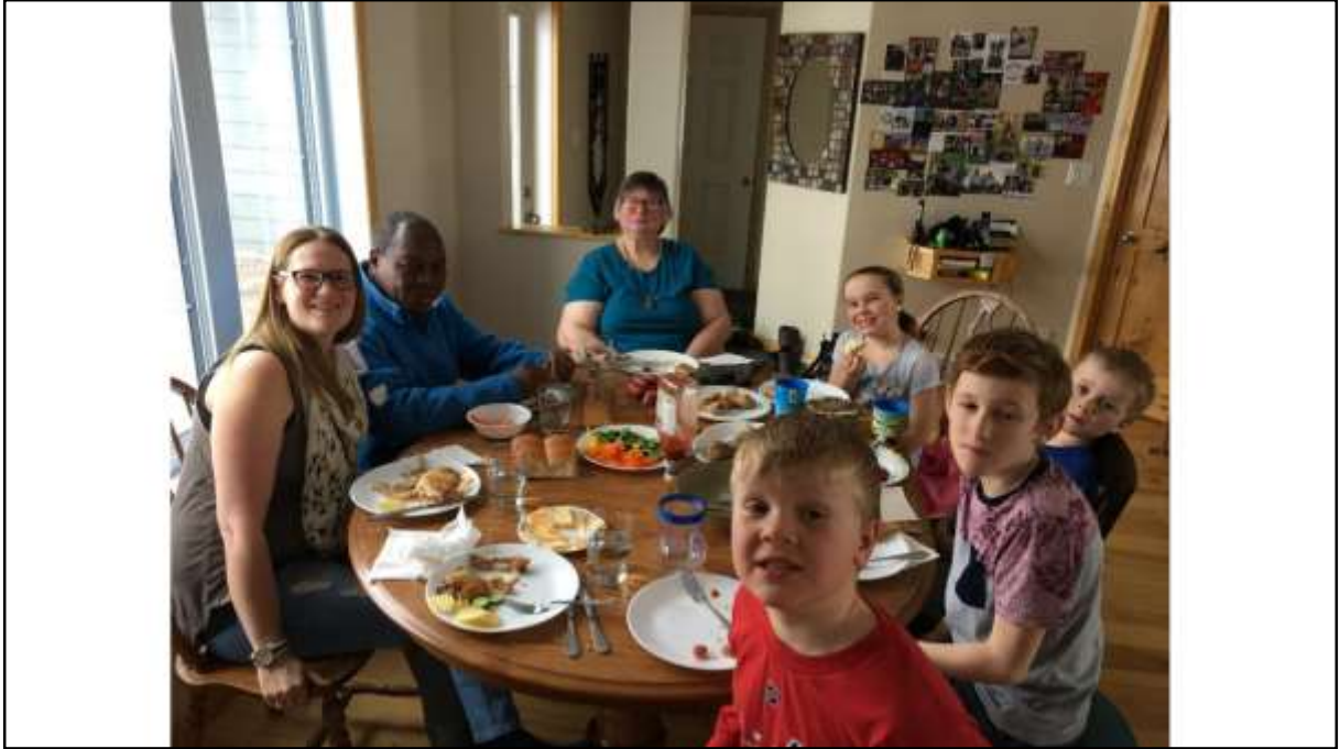
Lunch at Rivers, 2018