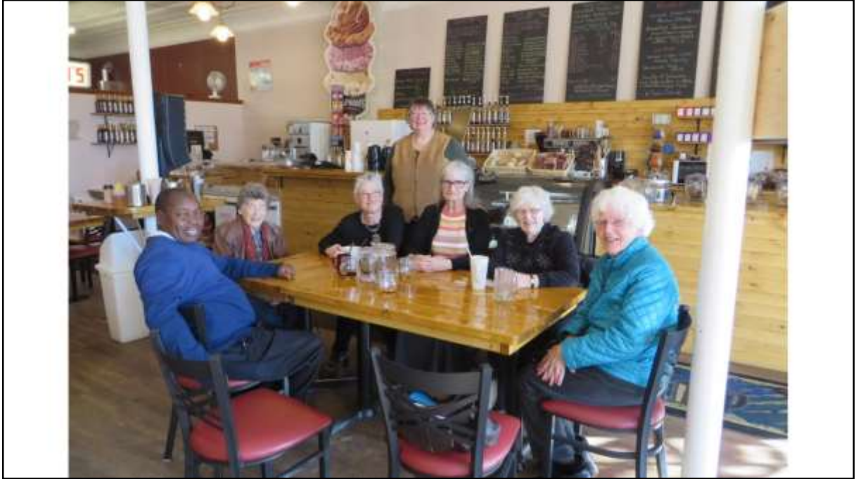
Basswood Women's Institute, Minnedosa, 2016