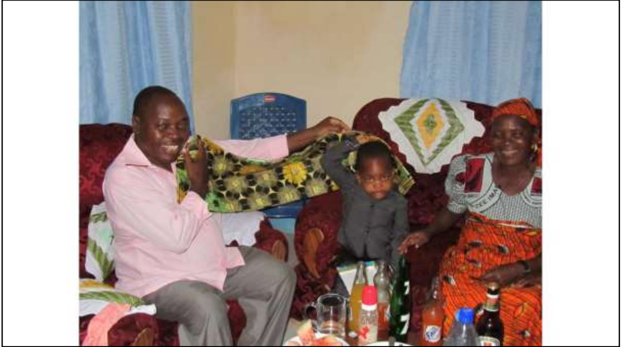
December 2013, with Adelika's mom