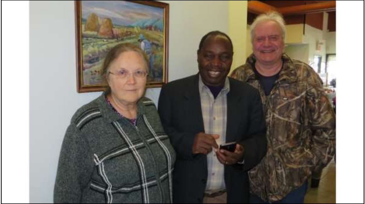
With Sebastian's, 2018