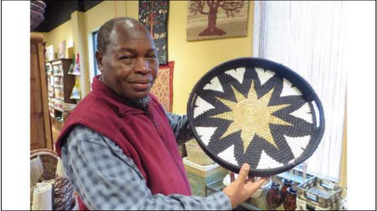
Ten Thousand Villages, Winnipeg, 2016