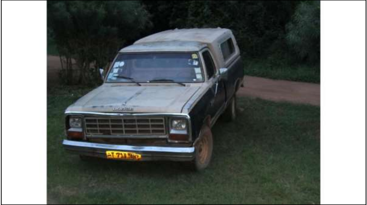
Dodge Ram in Tanzania