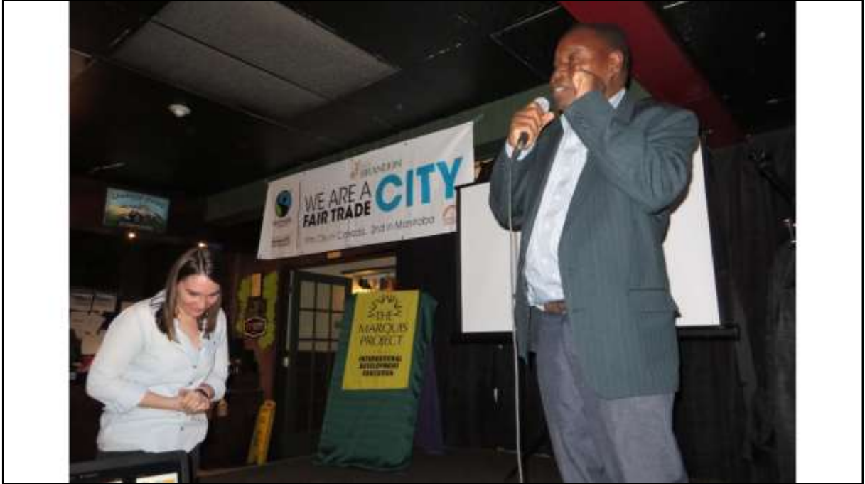
Fair Trade dinner, 2018