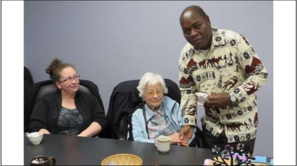
Marquis event, 2016