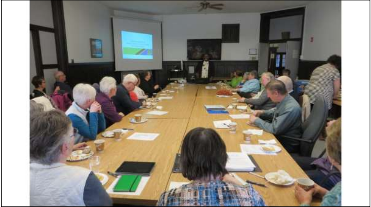
People to People meeting